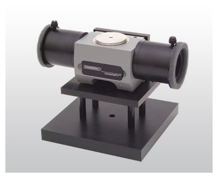
Figure 1. The ConcentratIR2™ multiple-reflection ATR accessory.